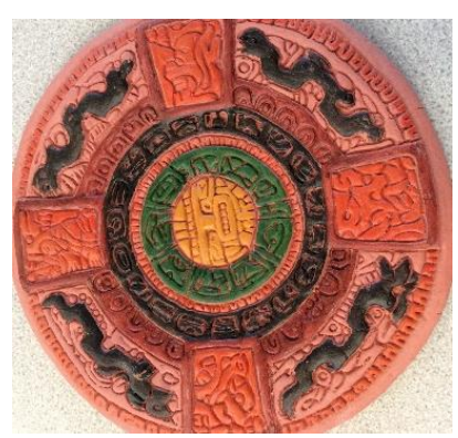
A Maya calendar