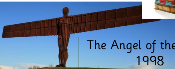
The Angel of the North 1998

-The Maya used masks for a variety of reasons and occasions. These included to adorn (decorate) the faces of the dead. To be worn at important events and to be worn during battle.