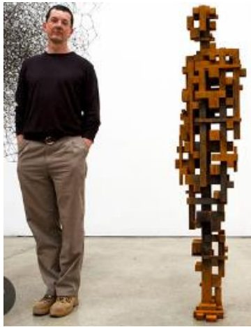
Period – Contemporary Art