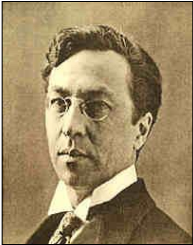
Period – Abstract/Expressionism