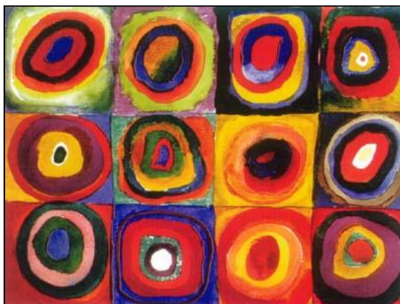
'Kandinsky's Circles' (Farbstudie Quadrate 1913)